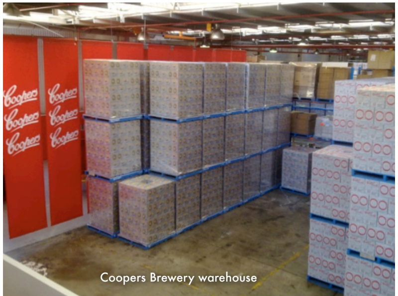
Coopers Brewery warehouse